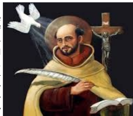
St. John of the Cross

The Carmelite mystic, St. John of the Cross, understood this well when he wrote, Mine are the heavens and mine is the earth. Mine are the nations, the just are mine, and mine the sinners. The angels are mine, and the Mother of God, and all things are mine; and God himself is mine and for me, because Christ is mine and all for me. What do you ask, then, and seek, my soul? Yours is all of this, and all is for you. Do not engage yourself in something less or pay heed to the crumbs that fall from your Father's table. Go forth and exult in your Glory! Hide yourself in it and rejoice, and you will obtain the supplications of your heart, (Sayings of Light and Love, #27).